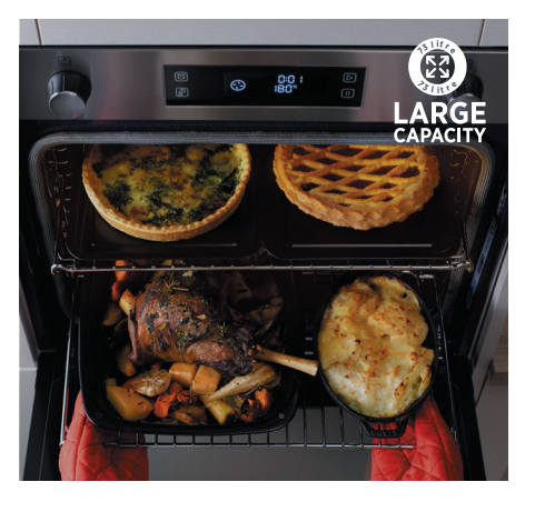
73L LARGE CAPACITY OVEN*

Let the oven take care of the cleaning for you. With easy clean enamel, catalytic liners or pyrolytic self cleaning function to choose from, all you have to do is wipe away the mess.